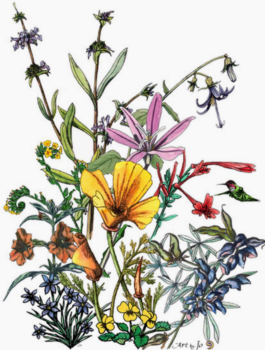
10 Wildflowers black sage, blue-eyed-grass, brodiaea, CA bluebells, CA fuchsia, CA poppy, fiddleneck, johnny jump-up, lupine, monkeyflower

Visit us at http://cw-c-fremontareawriters.org